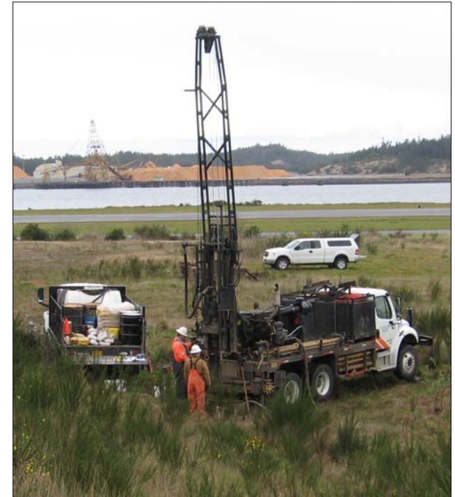
Geotechnical workers drill to collect soil samples for a previous bridge project.

Surveyors will be on-site, and geotechnical work will begin within the next two months.